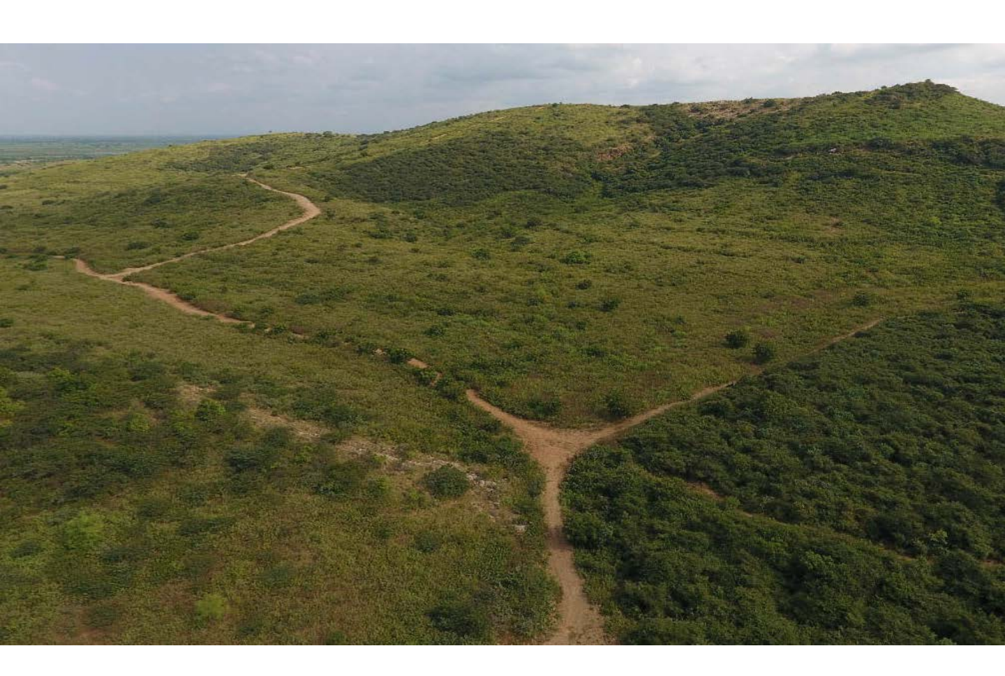
1000 ACRES OF PRISTINE LANDSCAPE